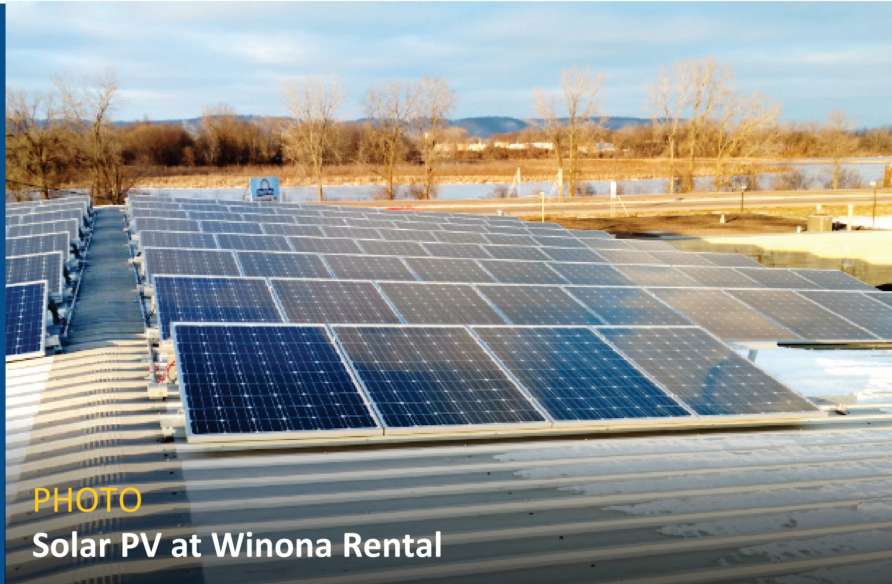
PHOTO Solar PV at Winona Rental