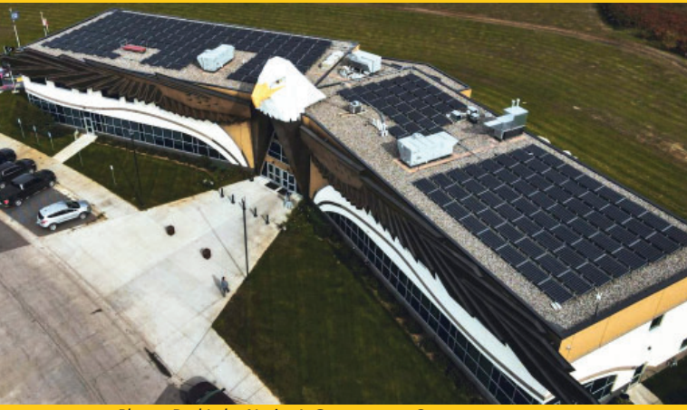
Photo: Red Lake Nation's Government Center, an energy producing & energy storage unit.