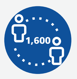
Hosted 34 events with over 1,600 attendees