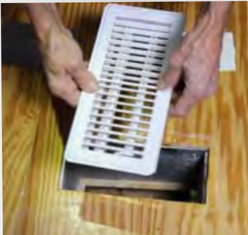
To do: Seal leaky air ducts