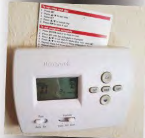
Yuav ua li ca rau thermostat