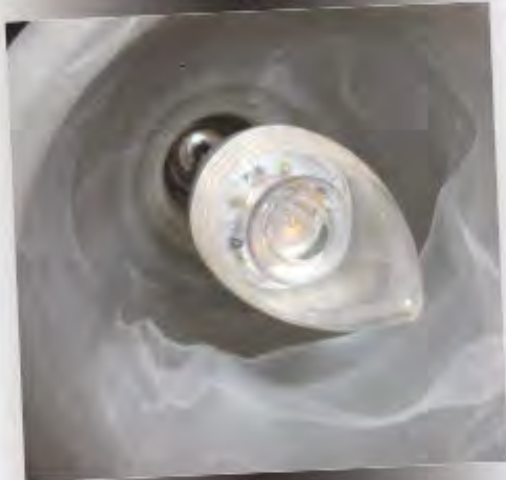
To do: Swap in LED light bulbs