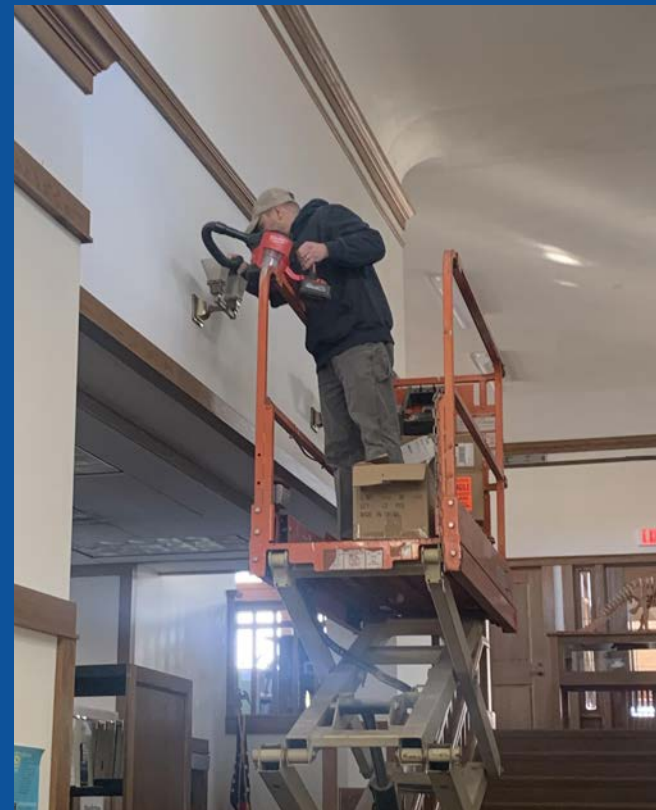
Replacing lights at Detroit Lakes Library