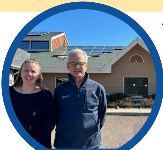
Solar in Tofte