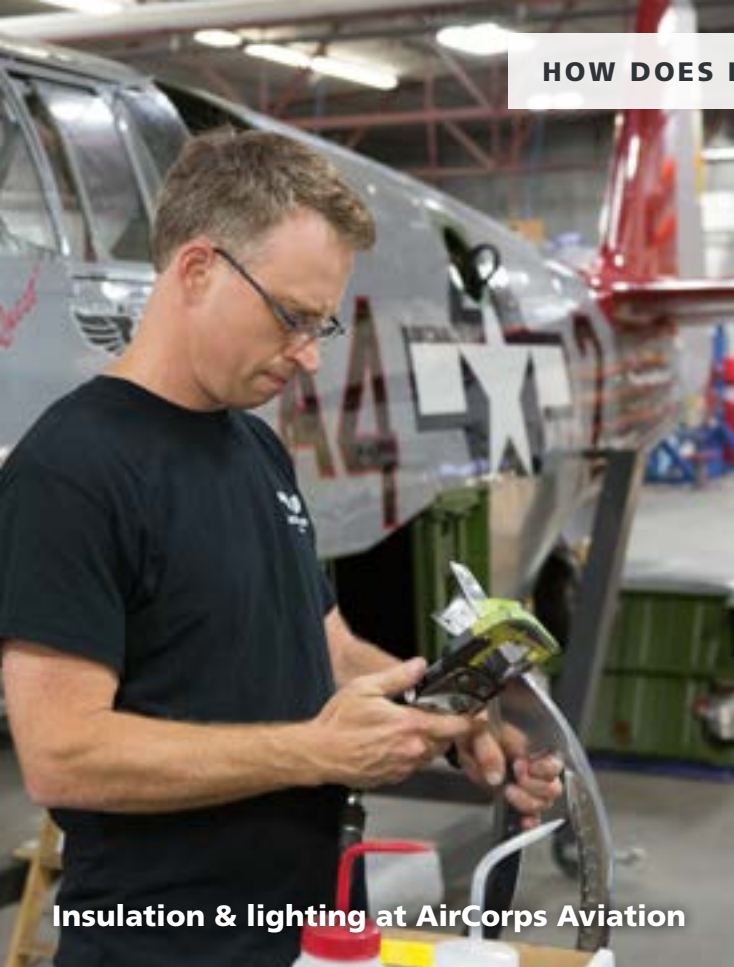
Insulation & lighting at AirCorps Aviation